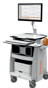
Nexam Pro, wireless professional urodynamic

Laborie offers a complete range of urodynamic systems, providing a high level of versatility and a customized solution for every practice! Our broad range of catheters, pressure transducers, filling tubes and EMG accessories completes our urodynamic product line.