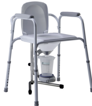
Flowsensor on a height adjustable flow stand under a micturition chair

Flowmaster is a computer based wireless flowmeter for quick, easy and convenient uroflowmetry.